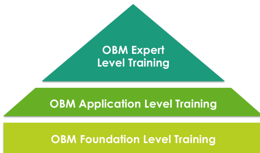
Figure 1: OBM Dynamics pathway. Expert level under development.

OBM training and certification is applicable to anyone with a responsibility for improving individual and team performance, including leaders, managers, consultants and human resources professionals.